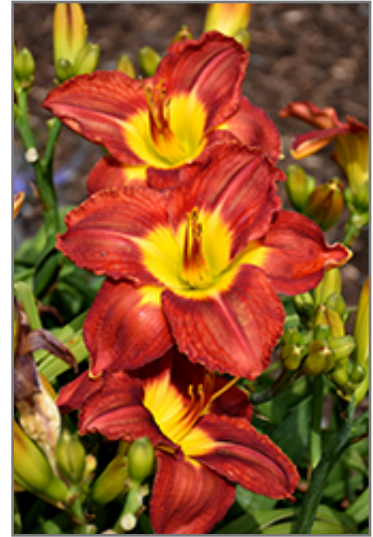
Passion For Red Daylily flowers