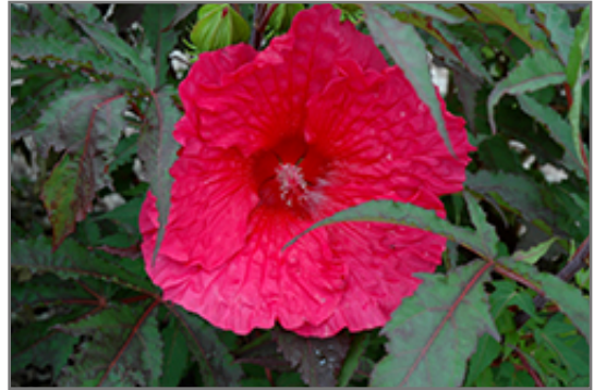
Plum Fantasy Hibiscus flowers