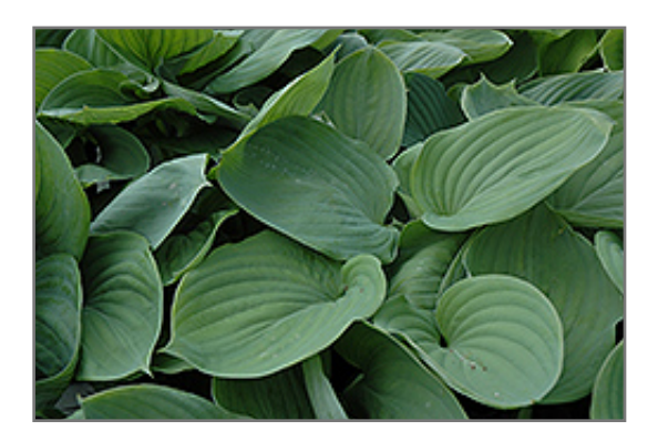
Gentle Giant Hosta foliage