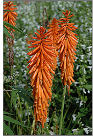
Rockette Orange Torchlily flowers