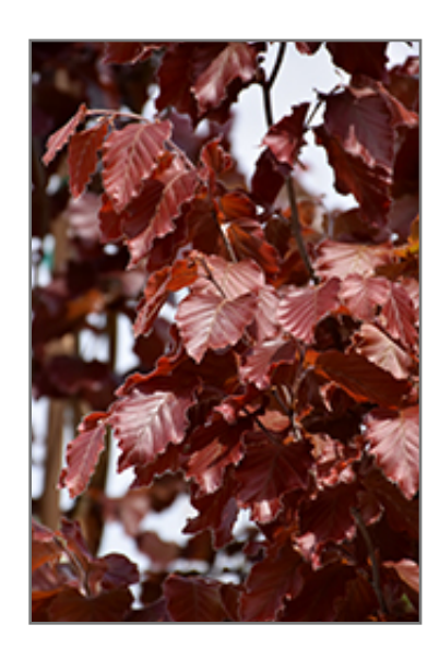
Red Obelisk Beech foliage