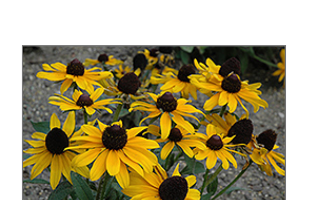
Corona Coneflower flowers

361 N. Hunter Highway Drums, PA 18222 (570) 788-4181 www.beechwood-gardens.com