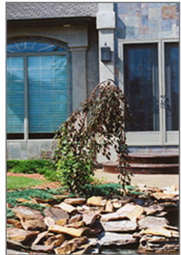
Royal Beauty Flowering Crab