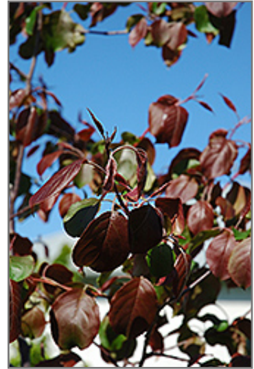
Rudolph Flowering Crab foliage

* This is a 'special order' plant - contact store for details