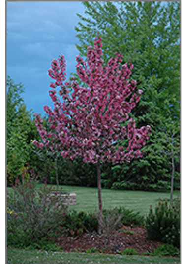
Rudolph Flowering Crab in bloom

Rudolph Flowering Crab is recommended for the following landscape applications;