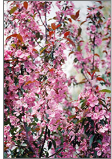
Shaughnessy Cohen Flowering Crab flowers