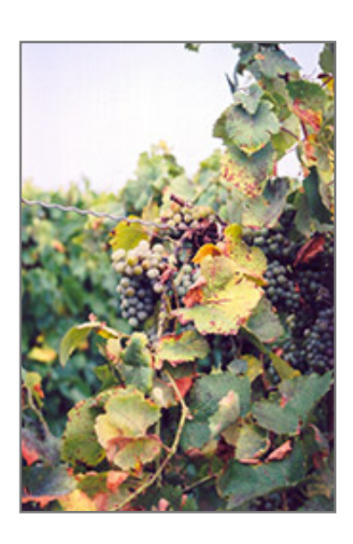
Gewurztraminer Grape fruit

Aside from its primary use as an edible, Gewurztraminer Grape is sutiable for the following landscape applications;