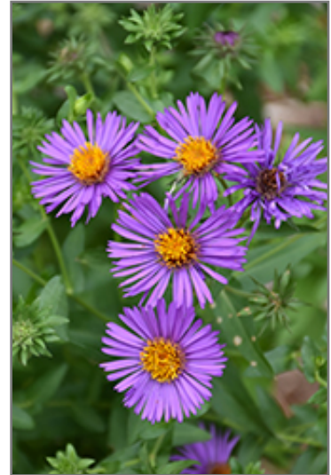
Purple Beauty Aster flowers