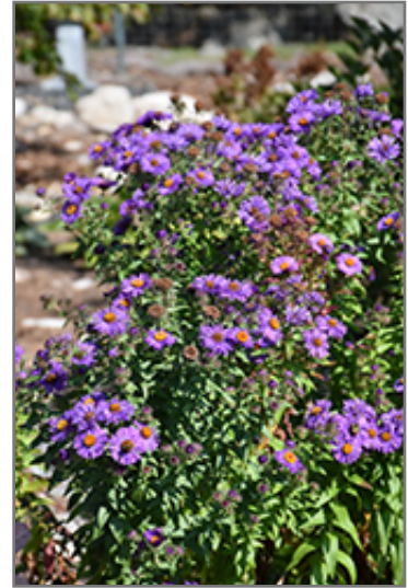
Purple Beauty Aster flowers

This plant does best in full sun to partial shade. It prefers to grow in average to moist conditions, and shouldn't be allowed to dry out. It is not particular as to soil type or pH. It is somewhat tolerant of urban pollution. This is a selection of a native North American species. It can be propagated by division; however, as a cultivated variety, be aware that it may be subject to certain restrictions or prohibitions on propagation.