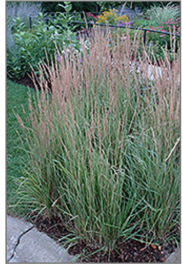
Variegated Reed Grass in bloom

This plant will require occasional maintenance and upkeep, and is best cut back to the ground in late winter before active growth resumes. It has no significant negative characteristics.