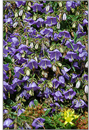
Bellflower flowers

Bellflower will grow to be only 4 inches tall at maturity, with a spread of 8 inches. Its foliage tends to remain low and dense right to the ground. It grows at a medium rate, and under ideal conditions can be expected to live for approximately 5 years. As an herbaceous perennial, this plant will usually die back to the crown each winter, and will regrow from the base each spring. Be careful not to disturb the crown in late winter when it may not be readily seen!