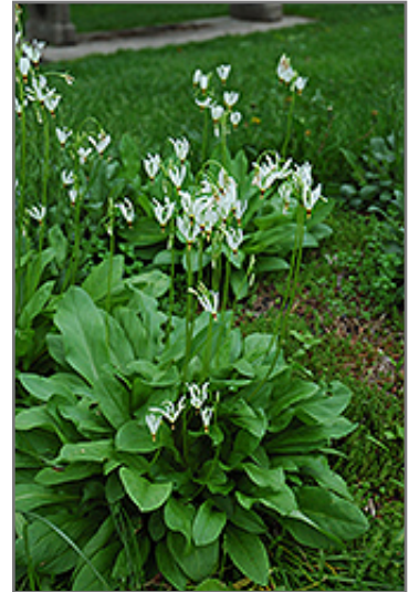
White Shooting Star in bloom