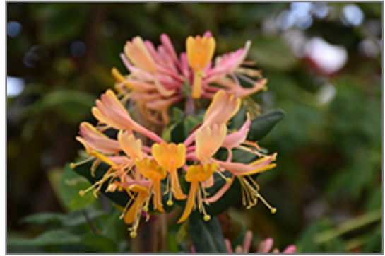
Goldflame Honeysuckle flowers