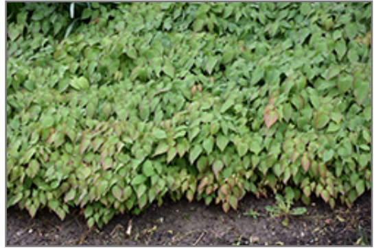
Bishop's Hat