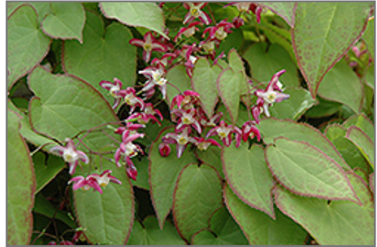
Bishop's Hat flowers

Bishop's Hat is a dense herbaceous evergreen perennial with a ground-hugging habit of growth. Its relatively fine texture sets it apart from other garden plants with less refined foliage.