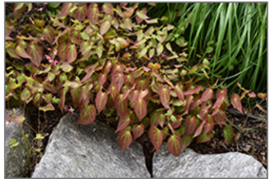
Bishop's Hat