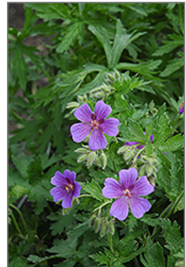
Showy Cranesbill flowers