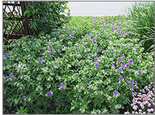
Showy Cranesbill in bloom

Showy Cranesbill will grow to be about 18 inches tall at maturity, with a spread of 24 inches. When grown in masses or used as a bedding plant, individual plants should be spaced approximately 20 inches apart. Its foliage tends to remain dense right to the ground, not requiring facer plants in front. It grows at a medium rate, and under ideal conditions can be expected to live for approximately 10 years. As an herbaceous perennial, this plant will usually die back to the crown each winter, and will regrow from the base each spring. Be careful not to disturb the crown in late winter when it may not be readily seen!