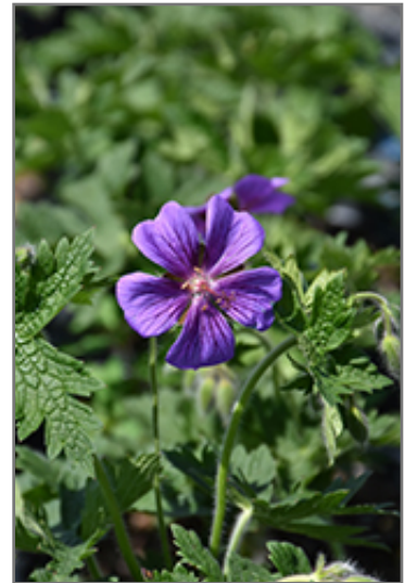
Showy Cranesbill flowers

Showy Cranesbill is recommended for the following landscape applications;