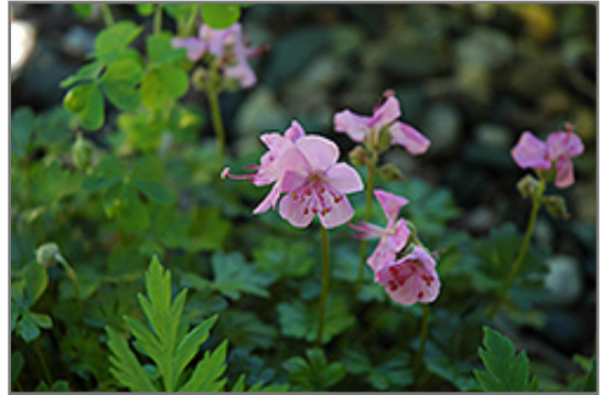
Claridge Druce Cranesbill flowers

Claridge Druce Cranesbill is recommended for the following landscape applications;