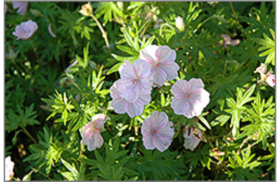
Creeping Bloody Cranesbill flowers