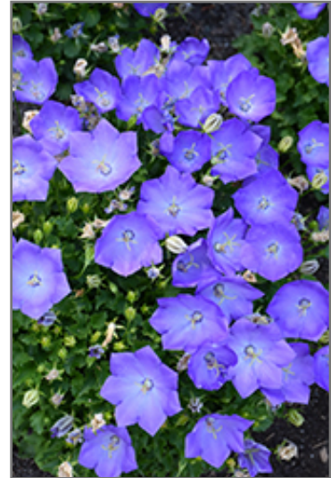
Rapido Blue Bellflower flowers