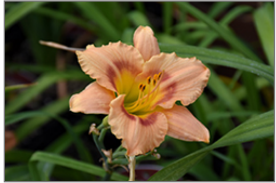
Buffy's Doll Daylily flowers