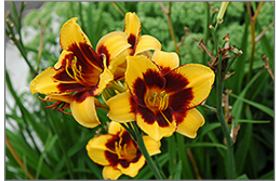
Exotic Love Daylily flowers

A striking addition to containers or perennial beds; beautiful golden yellow flowers with dark red centers rise above mounds of arching green foliage; blooms early to mid summer; easy to grow and low maintenance, good for any level of gardener