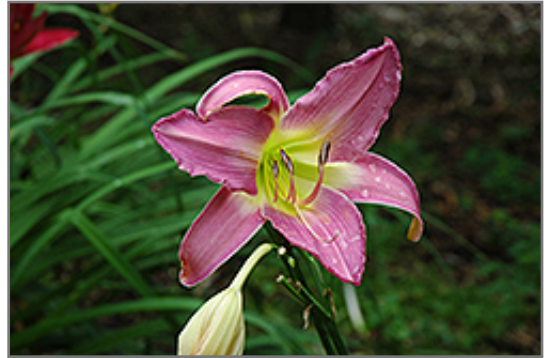
Lilting Lavender Daylily flowers

An early-midseason blooming selection, this variety features large, fragrant, lavender spider-like blooms with chartreuse throats; strong, sturdy stems rise above arching green foliage; a reliable rebloomer, great for perennial borders and beds