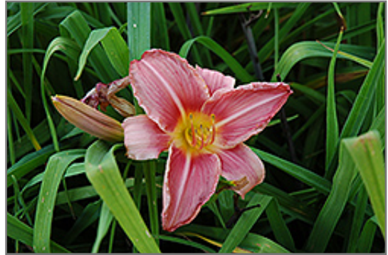
Mabel Fuller Daylily flowers

Deep red spider-like flowers with rich golden yellow centers stand out against arching green foliage; an easy to grow variety, great for any level of gardener; eye-catching in perennial borders, bed and containers; drought tolerant once established