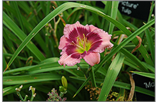
Mardi Gras Parade Daylily flowers

A compact, early-midseason selection that produces small, lavender flowers with burgundy eyezones, a chartreuse throat and pie crust edges; drought tolerant once established, great for perennial beds, borders or used in containers