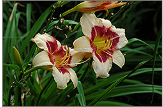
Monica Marie Daylily flowers