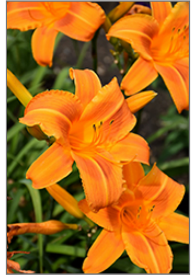
Rocket City Daylily flowers

An early-midseason bloomer, this selection features eye-catching orange flowers with copper eyezones; tall, sturdy stems rise above low growing mounds of arching green foliage; an easy to grow selection, great for perennial borders, beds and containers