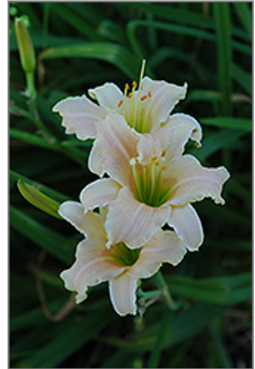
Treasured Lace Daylily flowers

Soft pink trumpet-like flowers with ruffled edges, white midribs and lime green throat; low growing mounds of slender, arching green foliage; early midseason blooming, great for softness in borders, beds and containers