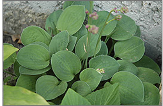
Baby Bunting Hosta foliage

Baby Bunting Hosta is recommended for the following landscape applications;