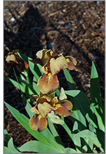
Parturient Iris flowers