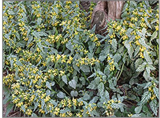
Hermann's Pride Yellow Archangel in bloom

This plant does best in partial shade to shade. It is an amazingly adaptable plant, tolerating both dry conditions and even some standing water. It is considered to be drought-tolerant, and thus makes an ideal choice for a low-water garden or xeriscape application. It is not particular as to soil type or pH. It is highly tolerant of urban pollution and will even thrive in inner city environments. This is a selected variety of a species not originally from North America. It can be propagated by division; however, as a cultivated variety, be aware that it may be subject to certain restrictions or prohibitions on propagation.