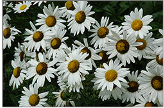
Alaska Shasta Daisy flowers

Alaska Shasta Daisy has masses of beautiful white daisy flowers with yellow eyes at the ends of the stems from early to late summer, which are most effective when planted in groupings. The flowers are excellent for cutting. Its serrated narrow leaves remain dark green in color throughout the season.