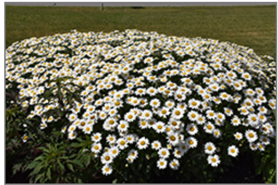
Becky Shasta Daisy in bloom