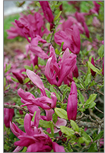
Susan Magnolia flowers