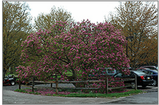
Susan Magnolia in bloom