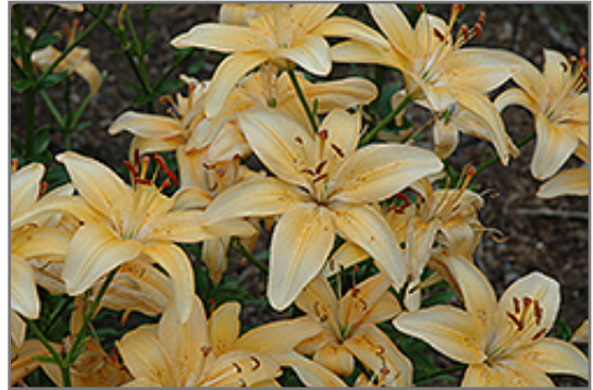
Butterscotch Lily flowers