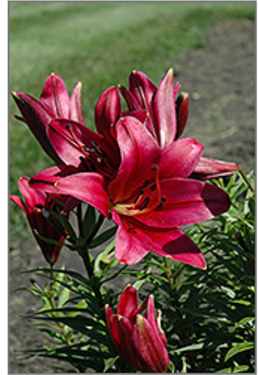
Flaming Belles Lily flowers

Flaming Belles Lily will grow to be about 30 inches tall at maturity, with a spread of 18 inches. When grown in masses or used as a bedding plant, individual plants should be spaced approximately 14 inches apart. It tends to be leggy, with a typical clearance of 1 foot from the ground, and should be underplanted with lower-growing perennials. It grows at a fast rate, and under ideal conditions can be expected to live for approximately 10 years. As an herbaceous perennial, this plant will usually die back to the crown each winter, and will regrow from the base each spring. Be careful not to disturb the crown in late winter when it may not be readily seen!