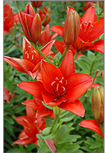
Iberflora Lily flowers

Iberflora Lily will grow to be about 20 inches tall at maturity, with a spread of 12 inches. When grown in masses or used as a bedding plant, individual plants should be spaced approximately 10 inches apart. It grows at a fast rate, and under ideal conditions can be expected to live for approximately 10 years. As an herbaceous perennial, this plant will usually die back to the crown each winter, and will regrow from the base each spring. Be careful not to disturb the crown in late winter when it may not be readily seen!