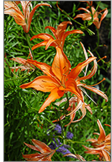
Lens Orangeade Lily flowers

Lens Orangeade Lily features bold orange spider-like flowers at the ends of the stems in early summer. The flowers are excellent for cutting. Its narrow leaves remain green in color throughout the season.