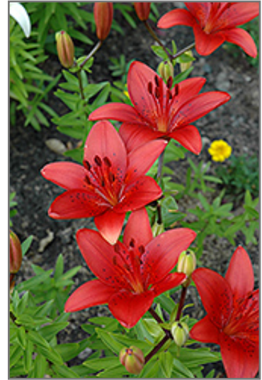
Lovelight Lily flowers

Lovelight Lily will grow to be about 30 inches tall at maturity, with a spread of 18 inches. When grown in masses or used as a bedding plant, individual plants should be spaced approximately 14 inches apart. It tends to be leggy, with a typical clearance of 1 foot from the ground, and should be underplanted with lower-growing perennials. It grows at a fast rate, and under ideal conditions can be expected to live for approximately 10 years. As an herbaceous perennial, this plant will usually die back to the crown each winter, and will regrow from the base each spring. Be careful not to disturb the crown in late winter when it may not be readily seen!