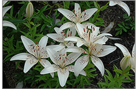
Matterhorn Lily flowers