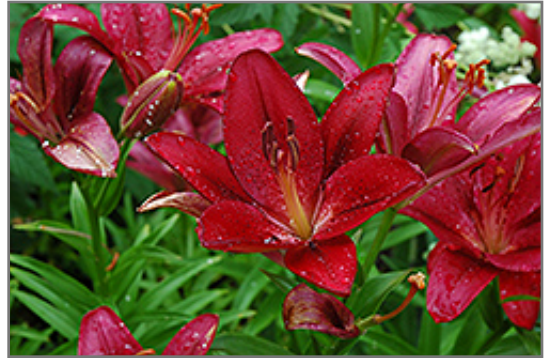
Rachel Lily flowers

Rachel Lily features bold crimson trumpet-shaped flowers with dark red stripes at the ends of the stems in early summer. The flowers are excellent for cutting. Its narrow leaves remain green in color throughout the season.