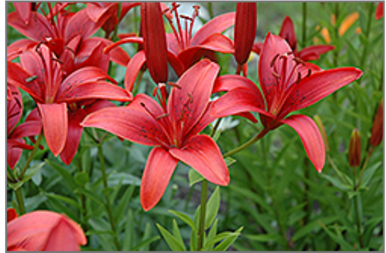
Red Duchess Lily flowers