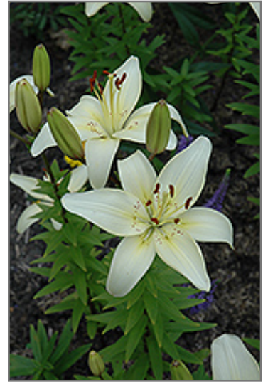
Roma Lily flowers

Roma Lily features bold creamy white trumpet-shaped flowers with light green throats and brown spots at the ends of the stems in early summer. The flowers are excellent for cutting. Its narrow leaves remain green in color throughout the season.