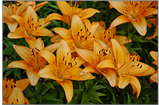
Sans Rafael Lily flowers