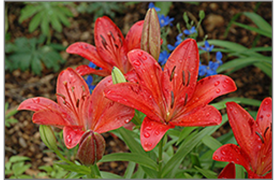
Science Fiction Lily flowers