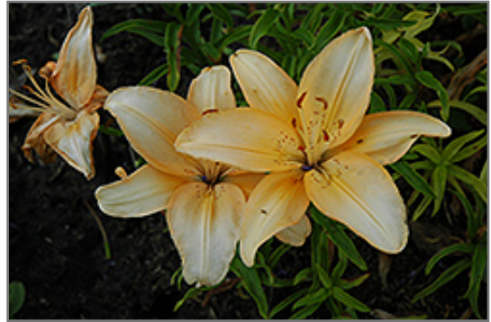
Trendsetter Lily flowers