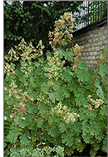
Plume Poppy in bloom