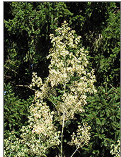
Plume Poppy flowers