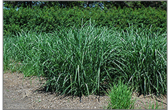
Silberturm Maiden Grass