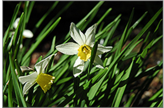
Jack Snipe Daffodil flowers