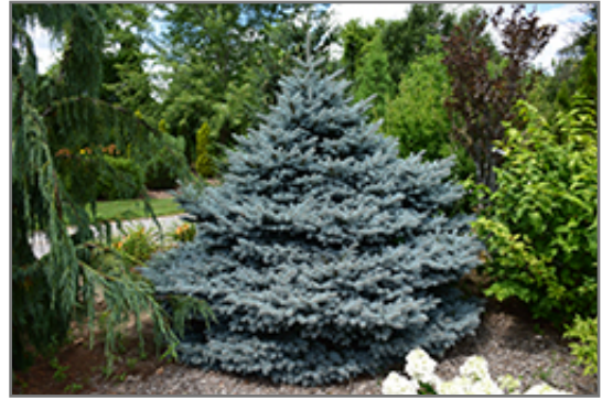
Montgomery Blue Spruce

Montgomery Blue Spruce will grow to be about 10 feet tall at maturity, with a spread of 8 feet. It has a low canopy, and is suitable for planting under power lines. It grows at a slow rate, and under ideal conditions can be expected to live for 60 years or more.